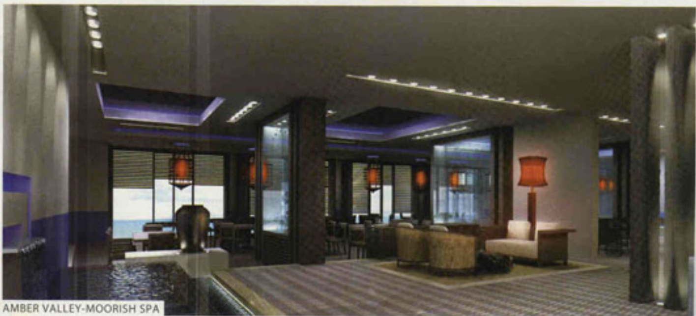
AMBER VALLEY-MOORISH SPA