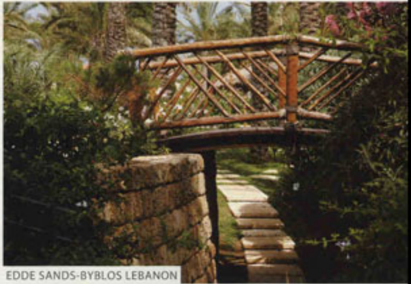
EDDE SANDS-BYBLOS LEBANON

Time and critical approaches to every single project. Developers in the Middle East are always in a hurry to commercialize their projects and this rarely leaves the time for architects to think and challenge their thoughts. Another important factor is to encourage synergies between local and internationally-renowned firms on joint-venture projects, as each will introduce their experiences and challenge the other in a constructive and creative manner. ■