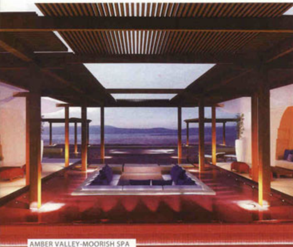
AMBER VALLEY-MOORISH SPA