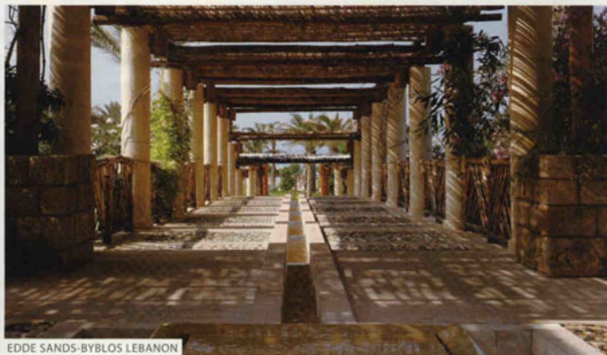
EDDE SANDS-BYBLOS LEBANON