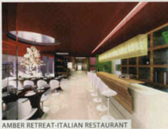
AMBER RETREAT-ITALIAN RESTAURANT