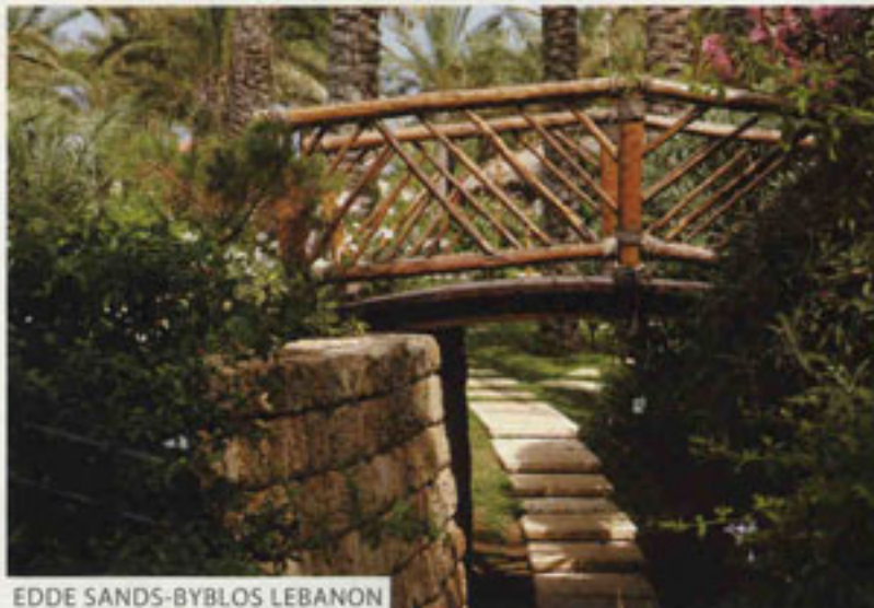
EDDE SANDS-BYBLOS LEBANON

Time and critical approaches to every single project. Developers in the Middle East are always in a hurry to commercialize their projects and this rarely leaves the time for architects to think and challenge their thoughts. Another important factor is to encourage synergies between local and internationally-renowned firms on joint-venture projects, as each will introduce their experiences and challenge the other in a constructive and creative manner. ■