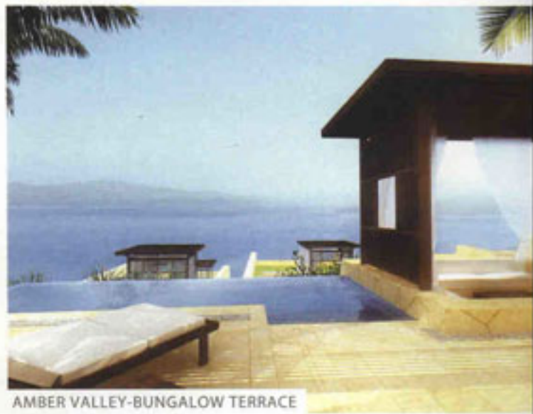
AMBER VALLEY-BUNGALOW TERRACE