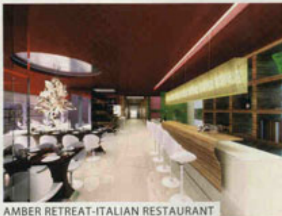
AMBER RETREAT-ITALIAN RESTAURANT