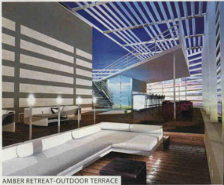
AMBER RETREAT-OUTDOOR TERRACE