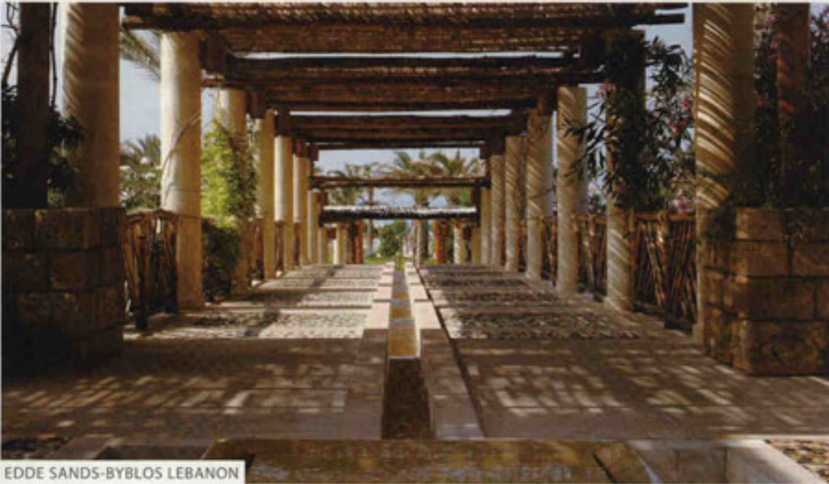
EDDE SANDS-BYBLOS LEBANON